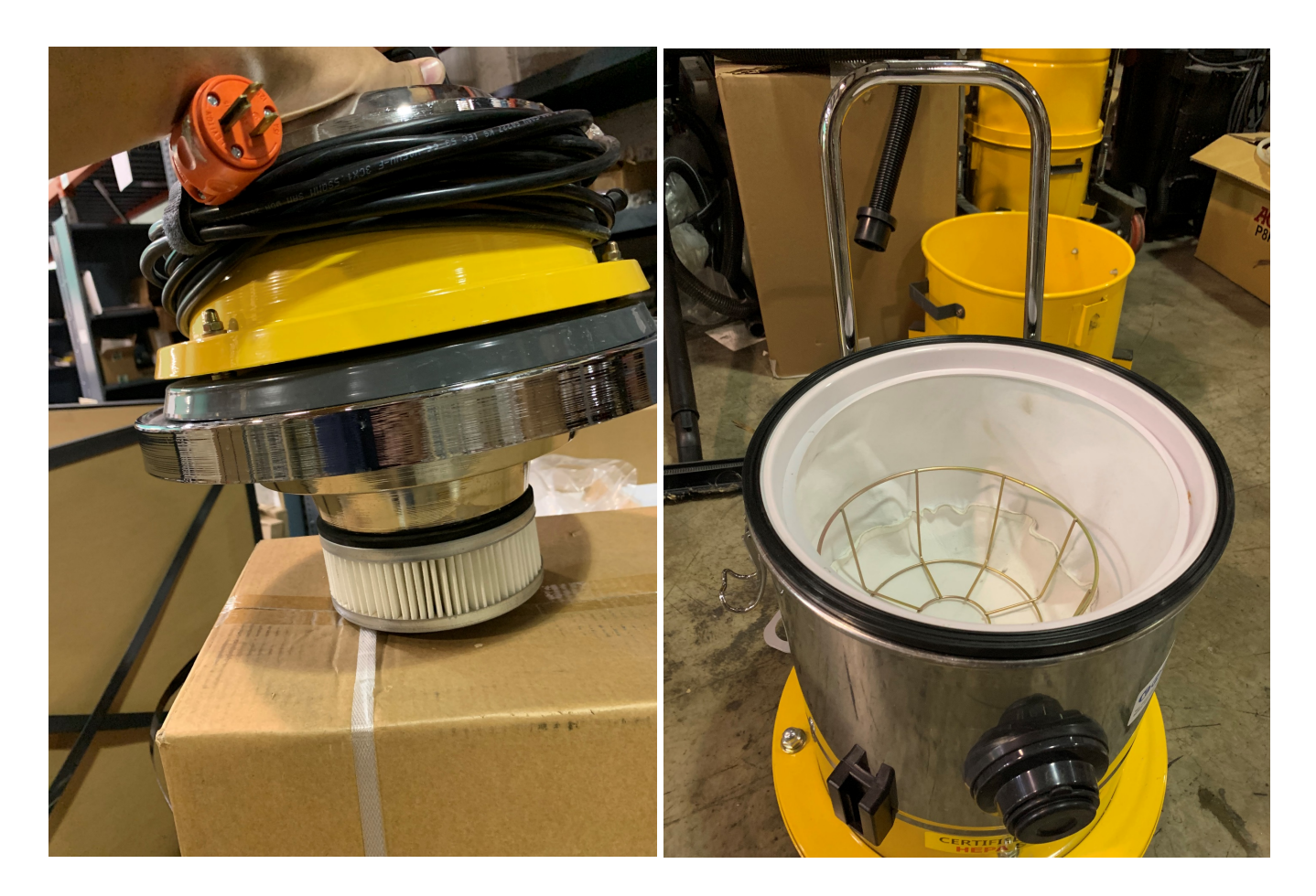
Note : The hepa filter, main filter and collection bag are all installed.