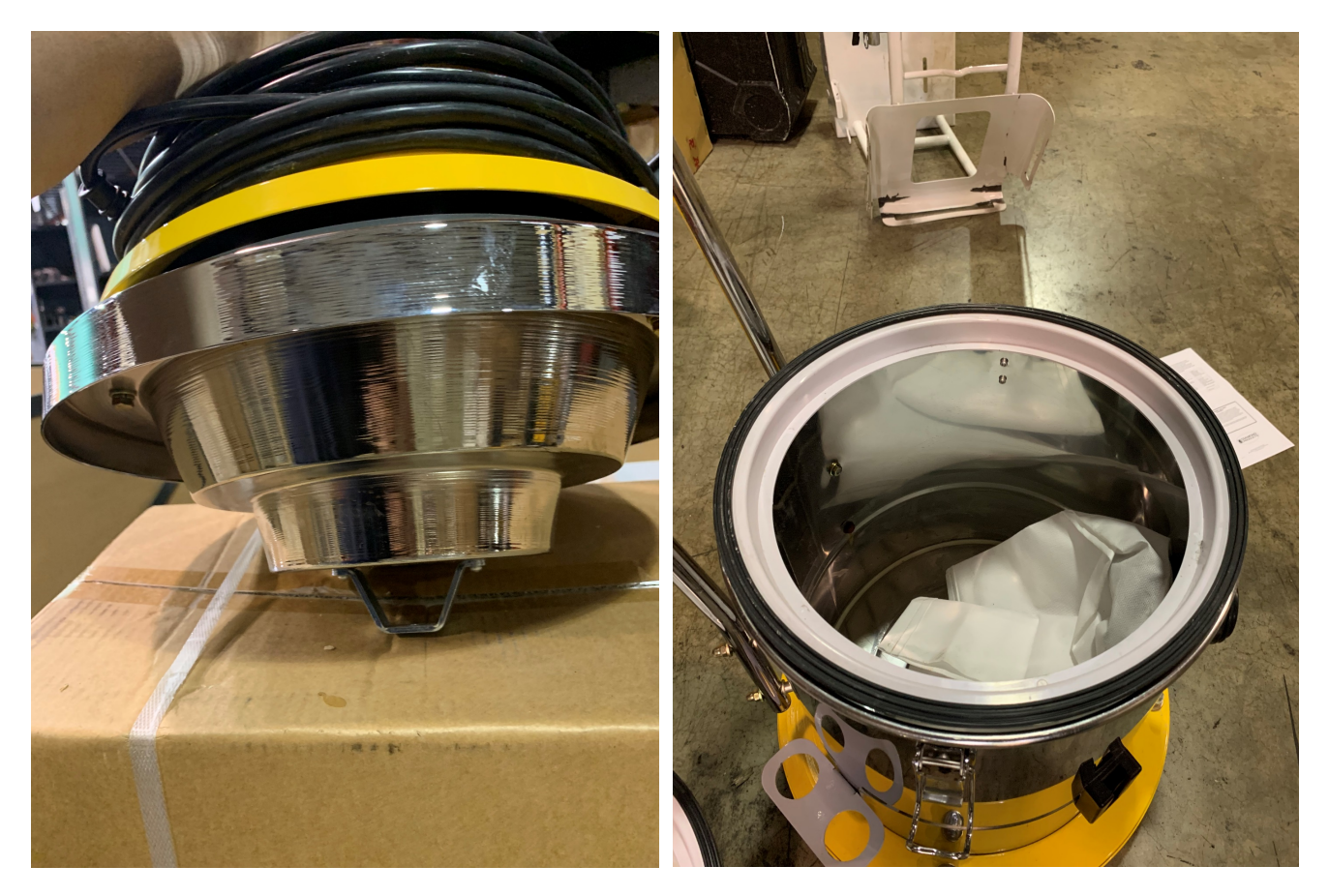
Note : The hepa filter, and main filter are not attached, while the rubber seal and collection bag are installed.