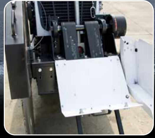
Easily Accessible Belts Multi-panel openings for quick belt maintenance.