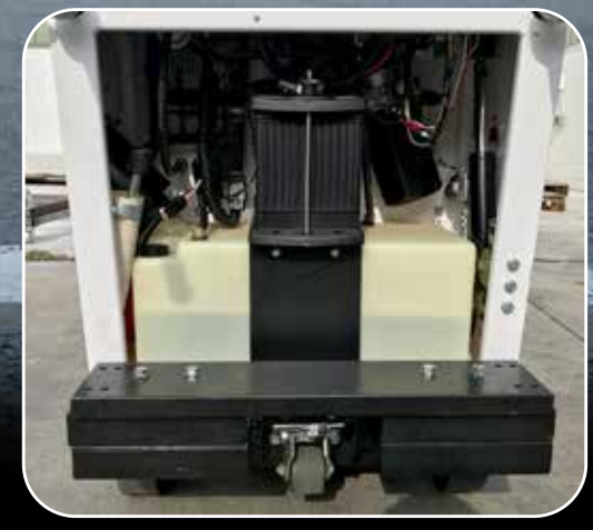
Simplified Serviceability Easy, open component access to speed routine maintenance