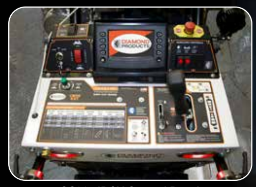
CC9074DCV Control Panel Detailed control instructions and computer readout for blade speed and engine setting. Can fold down to protect the screen.