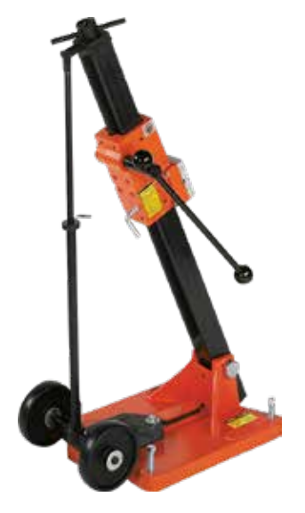
M1 Combination Angle Stand allows you to drill at variable angles.

Combination with vacuum & control panel Combination with vacuum, without control panel Combination without vacuum Combination angle Anchor Anchor without control panel