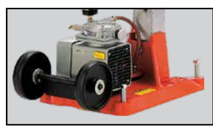
Combination Stand with Vacuum